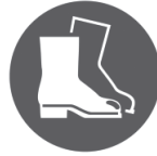
Wear protective footwear